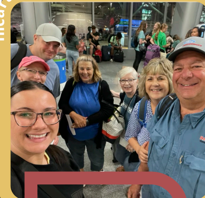
nicaragua missions trip