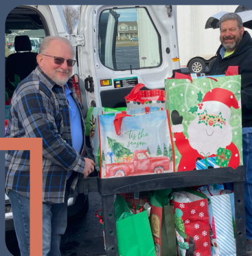
stevan dohanos christmas